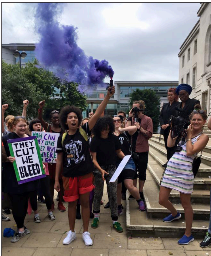
Sisters Uncut Hackney Town Hall

Like the ELFS, Sisters Uncut recognise how inequality cuts through all aspects of women’s lives. In July 2016, the East London collective of Sisters Uncut staged a march from Hackney town hall to Link Road, where they occupied an empty council flat in protest against the cuts in social housing. A Freedom of Information request revealed there were 1047 empty council properties in the borough, yet domestic violence victims were being sent to hostels or as far away as Essex to be housed. Like the Sumner House protestors before them, they gave a voice to the “faceless homeless”, asking: how can she leave there if she has nowhere to go?