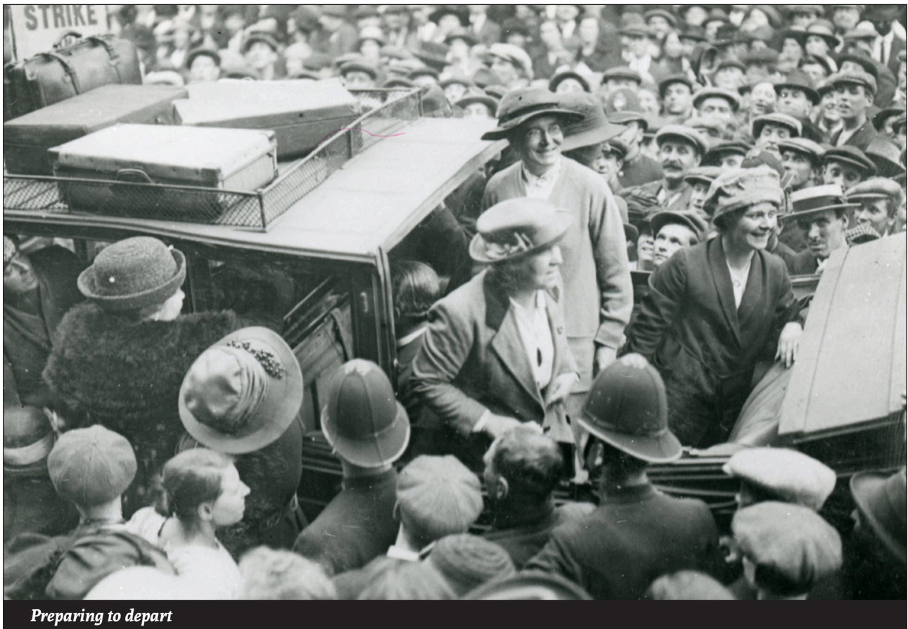
Preparing to depart