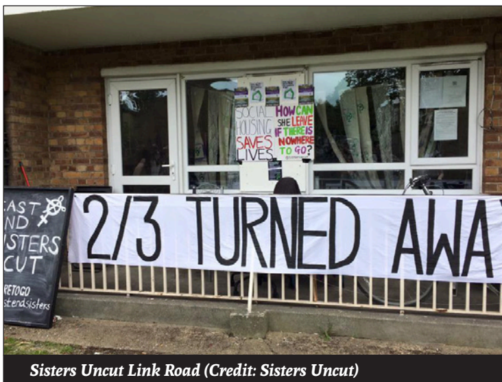
Sisters Uncut Link Road