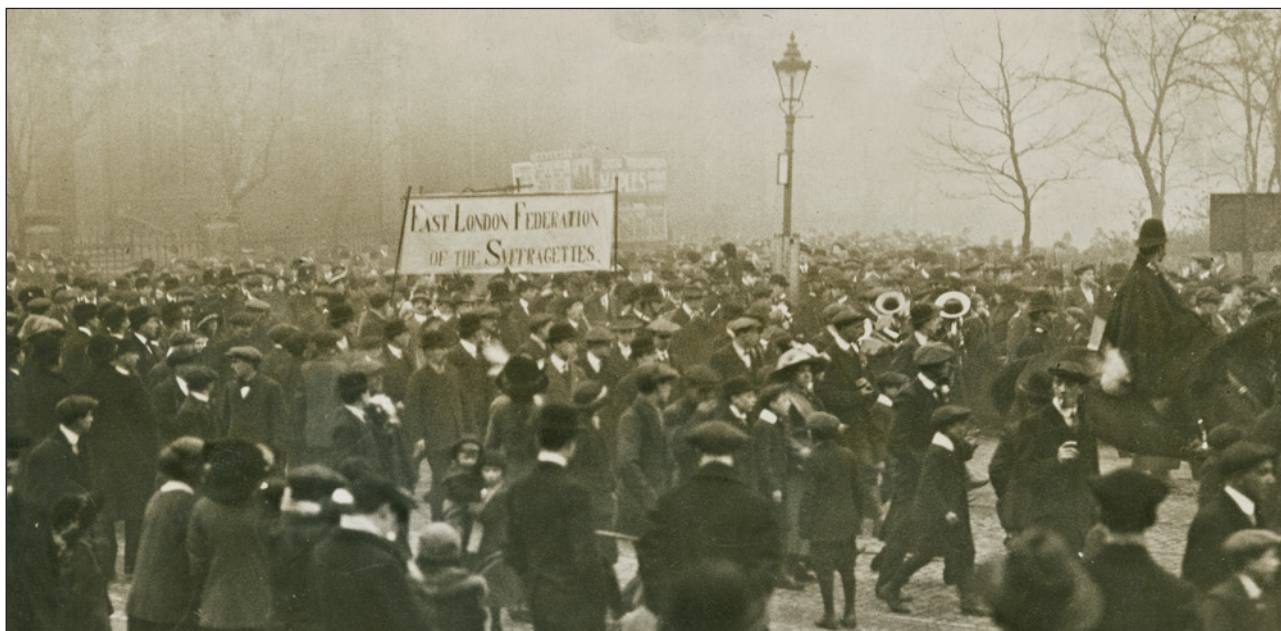
East London Federation of Suffragettes procession